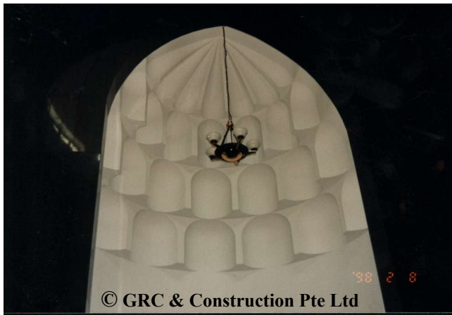
© GRC & Construction Pte Ltd